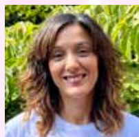
GRETTEL JIMÉNEZ-SINGER DIRECTOR NATIONAL WOMEN'S SHELTER NETWORK